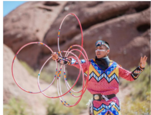
Annual Events in Greater Phoenix

HTTPS://WWW.VISITPHOENIX.COM/EVENTS/ANNUAL-EVENTS/